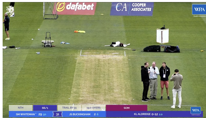
MAS being used in a TV-style broadcast with commentators, multiple cameras, and sophisticated graphics.

The point is, MAS will do its best to make your production as good as possible and we will eventually push you towards upgrading as much as you are comfortable doing so.