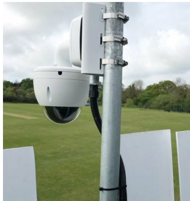
An internet connected IP/CCTV camera can also be a hassle-free MAS streaming system.

grained overlay controls. Most of our audience starts small and grows into these more sophisticated productions - we highly recommend doing this too to gain a bit of confidence and establish the basics of your community and how you may go about growing it.