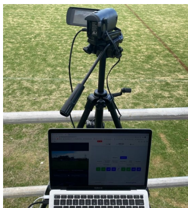
A camcorder plugged into a laptop is also a compatible MAS streaming system.

However, we do provide a simple set of recommendations to get you started in the most basic sense, but ultimately we want you to become passionate about streaming and the content you produce - and eventually consider mixing and matching all sorts of cameras and audio sources.